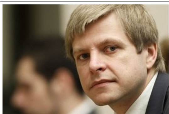
In this photo taken Friday, Dec. 16, 2011, Lithuania's Justice Minister Remigijus Simasius attends a meeting of officials in the President palace in Vilnius, Lithuania. Twenty years after gaining independence from the Soviet Union, the Baltic nations of Latvia and Lithuania still struggle to operate a functioning justice system despite their enthusiastic embrace of the West and entry into the European Union.